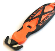
Klever Xchange Double

Print a brochure or read more about the knife here .