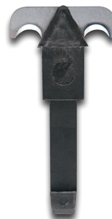
Klever Kurve All-Metal Head