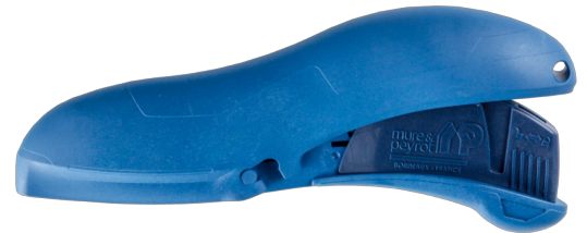
Safety Knife QUAIRIE ALD

The spring-loaded blade retracts automatically when the handle is released. 3 depths of cutting, 3 blades options to tailor to the cutting need. Handle can be locked in the closed position to prevent injuries. Easy to use, light and can be used with both the right and left hand.