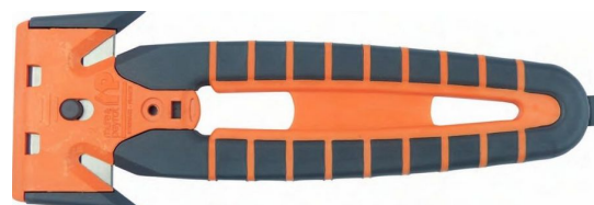
Safety Knife Arsac

Bi-material knife. Designed to cut adhesives, straps and tearing plastic packagings.