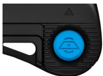
At the press of a button

From the right? From the left? From above? Regardless of how you want to activate the blade, all options are available with the SECUPRO MAXISAFE. What's more, the 3-sided slider is now grooved for better grip.