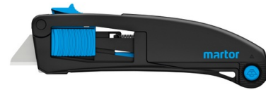
Secupro Maxisafe NO. 10130610

Your two hands alone are enough to change the blade. And these short instructions: press the blade change button and swing open the handle. Push the blade carrier to the front and you can change the blade. It's that