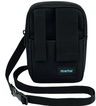
MARTOR BELT HOLSTER XXL

MARTOR BELT HOLSTER XXL 9924 Factsheet GB.pdf (3.26 MB)