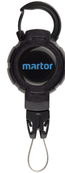
MARTOR TOOL RETRACTOR 9960