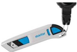
Compatible with most knives

To attach your MARTOR knife, remove the end piece. The steel cable loop is now much easier to open and close. Once the knife is attached, click the end piece back into place. Done!