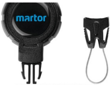
Detachable end piece

The TOOL RETRACTOR is ideal to hang on your belt loop. A simple flick of the wrist is all that is needed to hook it on. And when you want it somewhere else, that's quick and easy too.