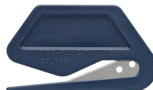
SECUMAX POLYCUT MDP 85007