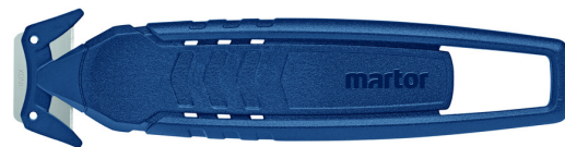
SECUMAX 150 MDP