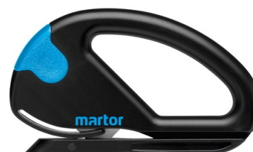
SECUMAX SNITTY NO. 43037

A paper and film cutter that guides the cutting material itself? Meet the SECUMAX SNITTY. Its integrated plastic material guide leads thin material in the direction of the blade, smoothing out bumps and preventing jamming. As with the similarly designed SECUMAX COUPPY, the blade lays at a 45° degree angle to the cutting material. An optimal angle for easy cutting.