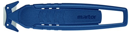
SECUMAX 150 MDP

The SECUMAX 150 MDP fits like a glove. It's so comfortable to hold, that it feels like an extension of your hand. With it you can cut cardboard, split tape, open plastic strapping... you can even scrape residue off surfaces.