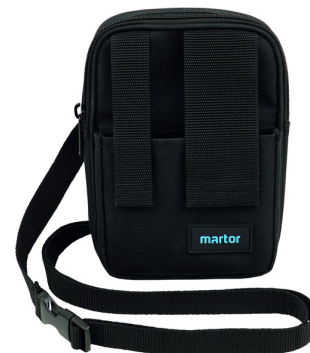
MARTOR BELT HOLSTER XXL

The Velcro flaps protect your cutting tools from falling out. You can also attach the flaps behind your safety knives. This way they are immediately